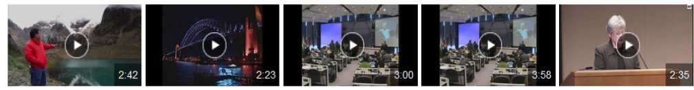
Glaciers melting at alarming rate... 2:42 Sydney Harbour Bridge in darkness to... 2:23 International global warming conference... 3:00 WRAP International global warming... 3:58 The Bulletin of Atomic Scientists says... 2:35